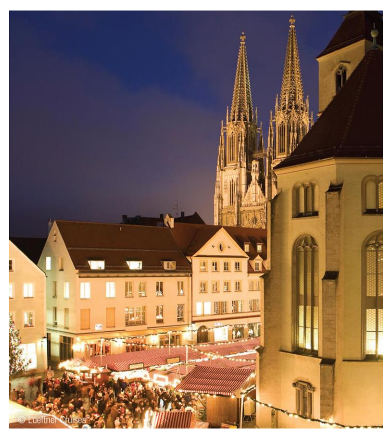
9 Days • 19 Meals: 7 Breakfasts, 5 Lunches, 7 Dinners

HIGHLIGHTS... Vienna, 6-Night Danube River Cruise, Hofburg Palace, Vienna Opera House, Wachau Valley, Glühwein Party, Passau, Regensburg, Nuremberg, Rothenburg, Würzburg, Christmas Markets