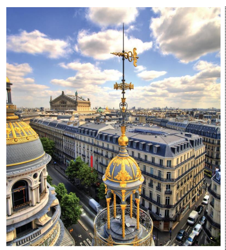
8 Days • 9 Meals : 6 Breakfasts, 3 Dinners

HIGHLIGHTS... The Tower of London, Trafalgar Square, Big Ben, Borough Market, Eurostar Train, Montmartre, Paradis Latin Cabaret, Arc de Triomphe, Eiffel Tower Dinner, Seine River Cruise