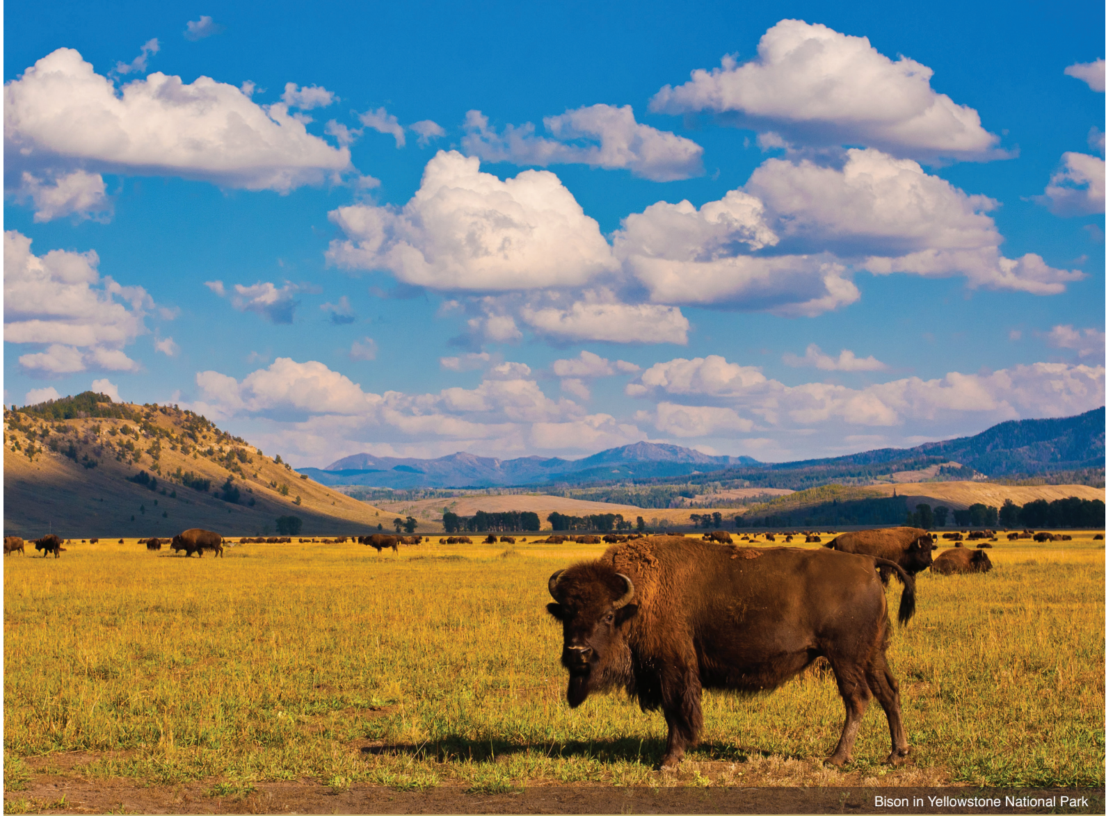
Bison in Yellowstone National Park