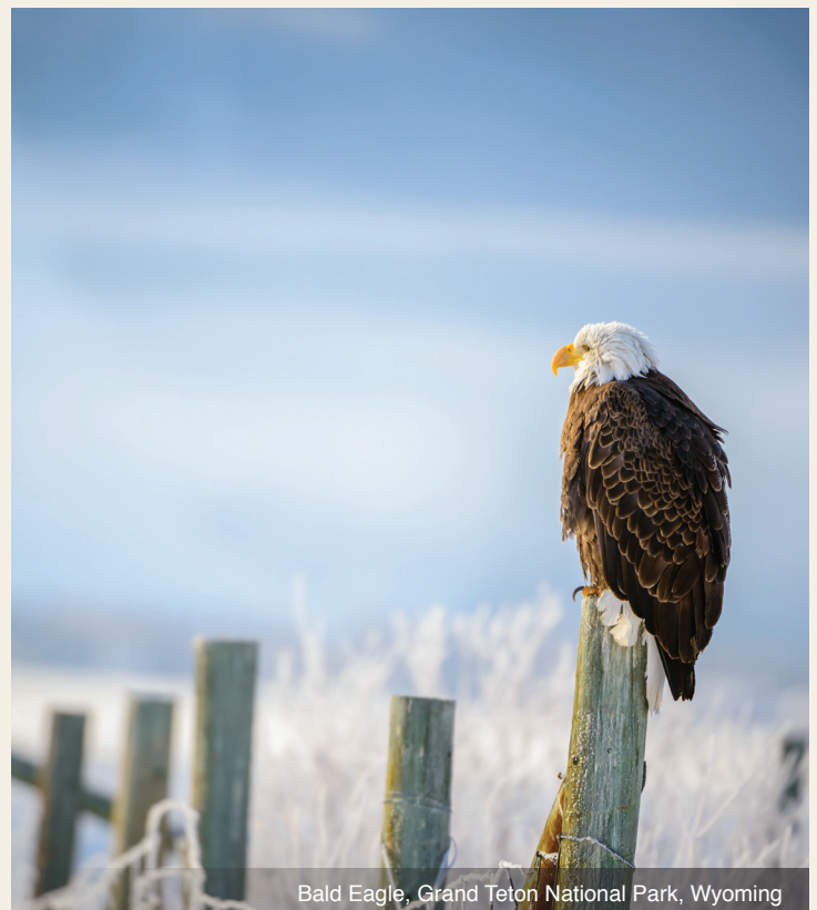
Bald Eagle, Grand Teton National Park, Wyoming

After breakfast transfer to the Salt Lake City International Airport for flights home anytime today. Meal: B