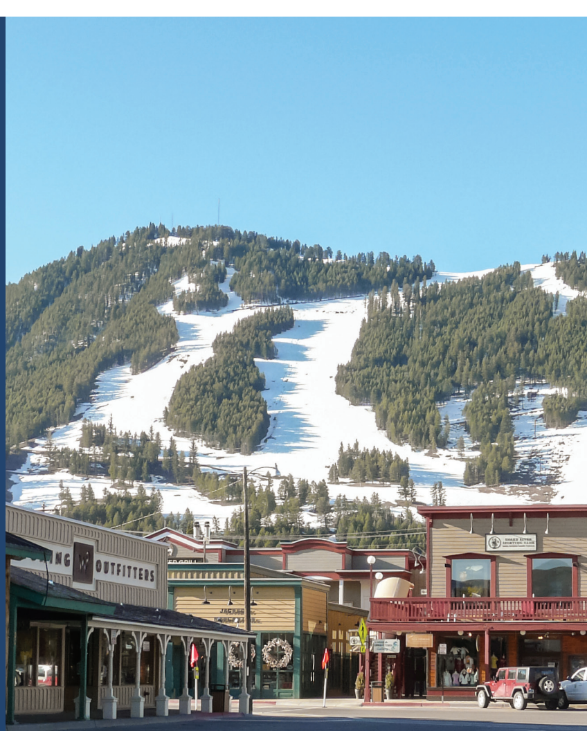
Jackson Hole, Wyoming