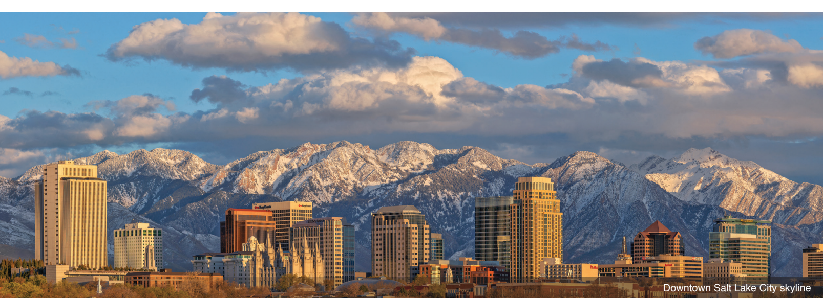
Downtown Salt Lake City skyline