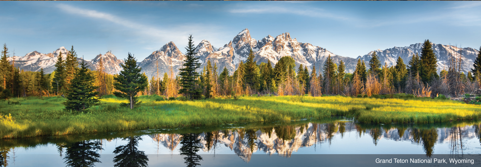
Grand Teton National Park, Wyoming

Memorial Parkway into magnificent Grand Teton National Park, drive alongside lovely Jackson and Jenny Lakes, visit the Chapel of the Transfiguration, while, of course, enjoying splendid views of the rugged, towering Tetons along the way. Tonight, the dinner bell will call you to the Bar J Chuckwagon for an evening of song, stories, entertainment and authentic cowboy chow. Meals: B, D