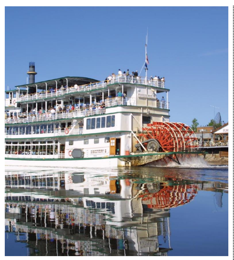
12 Days ● 26 Meals : 11 Breakfasts, 7 Lunches, 8 Dinners

HIGHLIGHTS... Fairbanks, Sternwheeler Discovery, Fannie Q's Saloon, Denali National Park, Tundra Wilderness Tour, Luxury Domed Rail, Anchorage, Hubbard Glacier, Glacier Bay, Skagway, Juneau, Ketchikan, Inside Passage